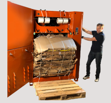
Simply push two buttons for bale ejection!